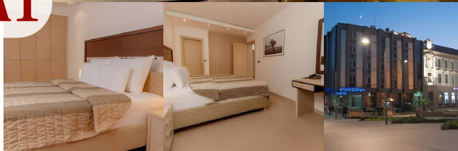
City center, 10 minutes walking distance from the competition hall, 3 minutes by car.