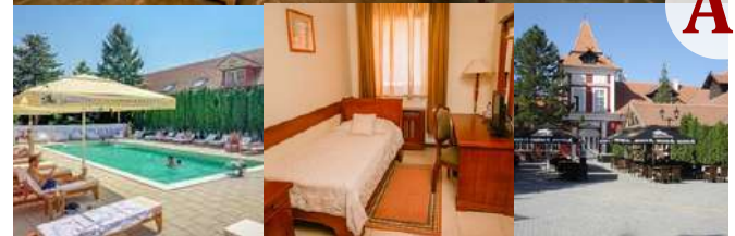
Located 6 km from the competition venue, surrounded by nature with a peaceful atmosphere.