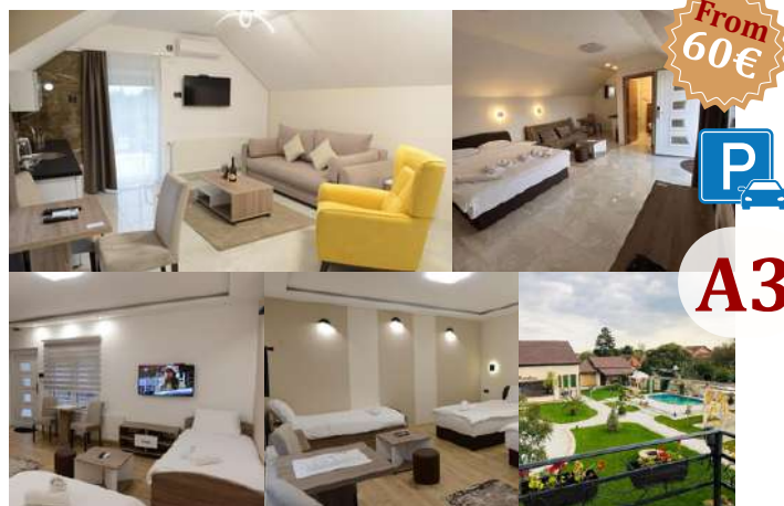
Located 3 km from the sports hall, in a quiet part of the city, 7 minutes by car.